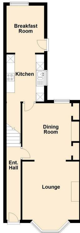
Ground Floor Approx. 49.5 sq. metres (532.4 sq. feet)